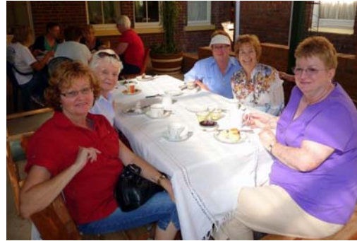
Ladies activities on and off the airfield