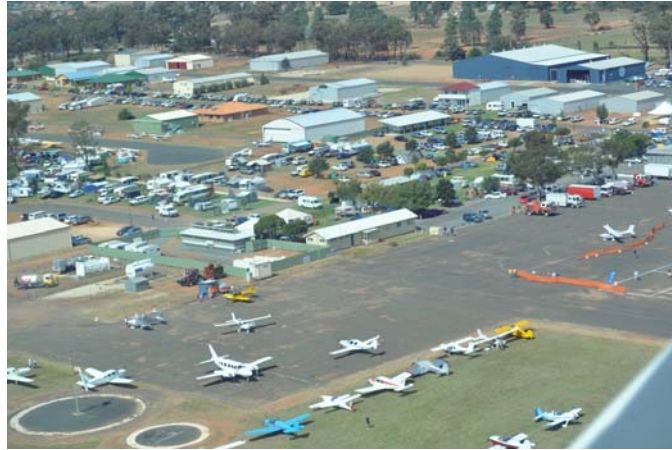
Natfly at Temora Airfield 2010

Plans are well underway for Natfly 2011. Here is a sneak preview of some of the activities: